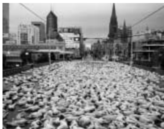
Spencer Tunick, "Melbourne 1, Edition 1/6", 2001, Chromogenic Colour Print, 1803 x 2267mm